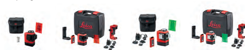
Lino L6Rs Article No. 918976